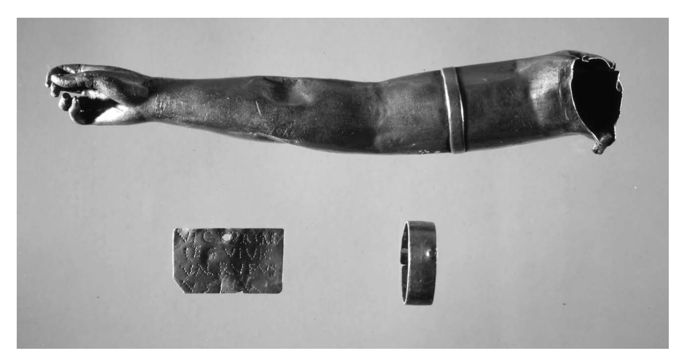
Fig. 1 — The silver arm, loose armilla and inscribed plaque found at Tunshill, Lancashire. Length of arm 224 mm.

arm. The proportions of the arm and the attached inscription suggest that the figure to which the arm belonged was female.